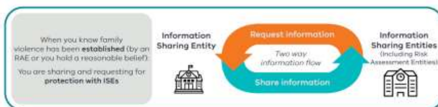
Figure 2: Overview of activities when sharing information for risk management (protection)

This opens a two-way flow of information that enables ISEs to form a complete picture of risk and collaborate to support children and parent/guardian experiencing family violence.