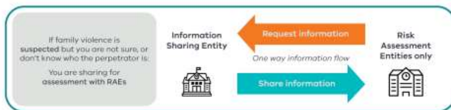
Figure 1: Overview of activities when sharing information for risk assessment

Family violence risk assessment is an ongoing process and is required at different points in time from different service perspectives. Education and care services will have a role in working collaboratively with other services to contribute to ongoing risk assessment and management of family violence.